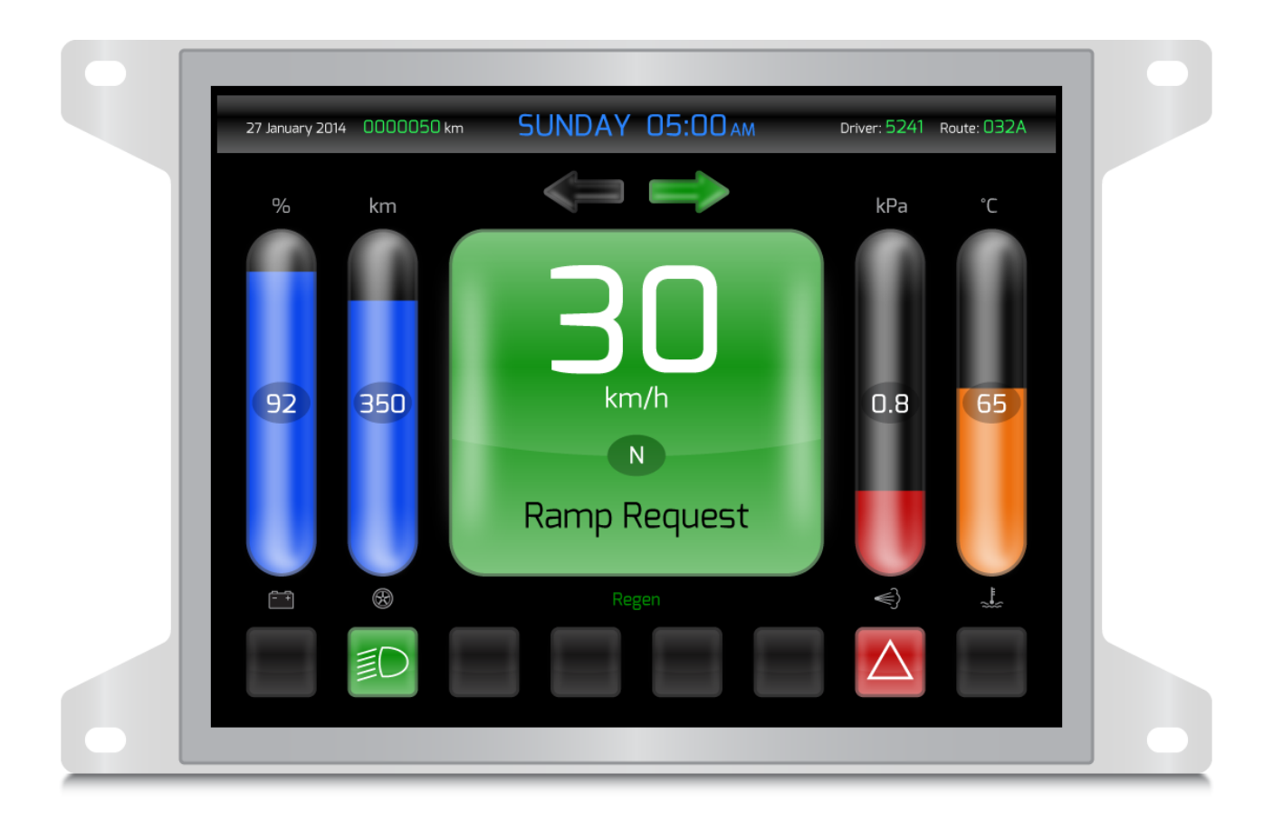
Fig. 1. VIC Lomonosov Z.

VIC Lomonosov Z is a digital instrument cluster for public transportation. This high-performance embedded graphics processor features high-brightness display, avionic aluminum housing and aerospace interface connector.